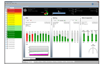
Transformer health/risk overview