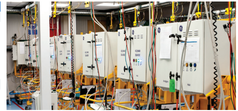
DGA 900 being tested in the factory

*whichever is greater. Accuracy quoted is the accuracy of the detectors during calibration. Gas-in-oil measurement may be affected by oil type and condition. Repeatability as measured from final production test data. ** N 2 value is calculated and available on free-breathing transformers only.